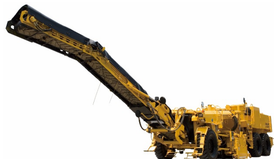
ROAD PLANER ER552F 28,090Kg (61,930Lb)