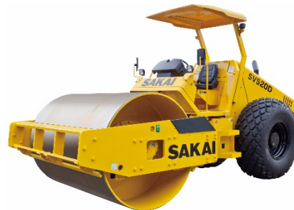
VIBRATORY SINGLE DRUM ROLLER SV520D 10,100Kg (22,265Lb)