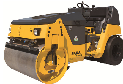
VIBRATORY DOUBLE DRUM ROLLER TW504 3,620Kg (7,980Lb)