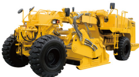
ROAD RECLAIMER PM550 22,500Kg (49,600Lb)