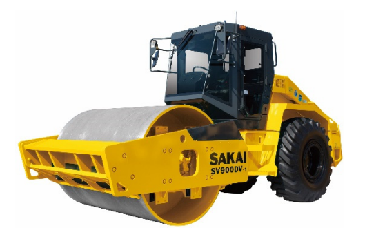
VIBRATORY SINGLE DRUM ROLLER SV900DV 20,030Kg (44,460Lb)