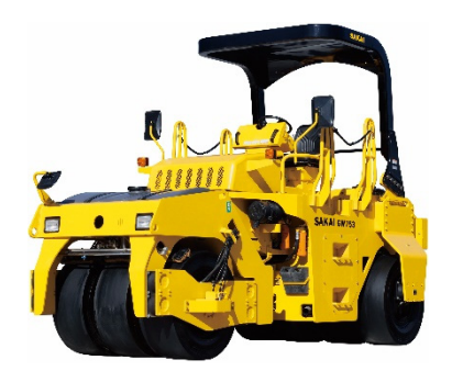
VIBRATORY PNEUMATIC TIRED ROLLER GW753 9,160Kg (20,195Lb)