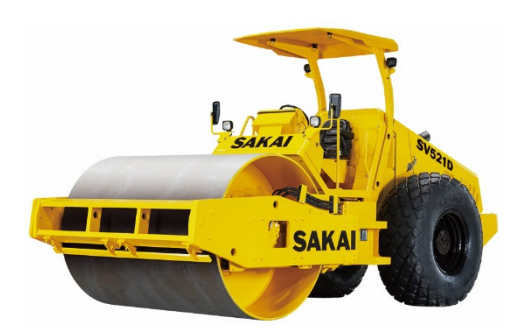
VIBRATORY SINGLE DRUM ROLLER SV521D 10,325Kg (22,765Lb)

Contact us SAKAI HEAVY INDUSTRIES, LTD. International Business Headquarters TELEPHONE: +81-3-3431-9971 Website: https://www.sakainet.co.jp/en/ Facebook: https://www.facebook.com/Sakai.Tokyo.Japan