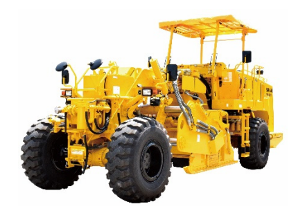
ROAD STABILIZER PM550-s 22,580Kg (49,780Lb)

Contact us SAKAI HEAVY INDUSTRIES, LTD. International Business Headquarters TELEPHONE: +81-3-3431-9971 Website: https://www.sakainet.co.jp/en/ Facebook: https://www.facebook.com/Sakai.Tokyo.Japan