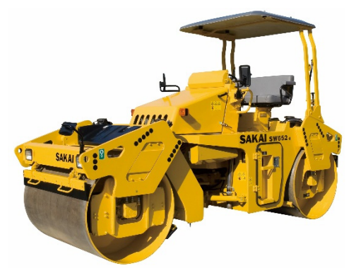
VIBRATORY DOUBLE DRUM ROLLER SW652H-1K/SW654H 8,080Kg (17,815Lb)