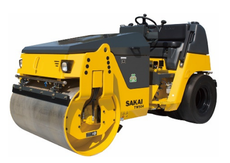
VIBRATORY DOUBLE DRUM ROLLER TW504 3,620Kg (7,980Lb)