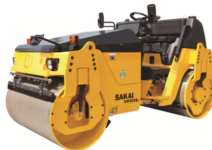
VIBRATORY DOUBLE DRUM ROLLER SW502 4,090Kg(9,020Lb)