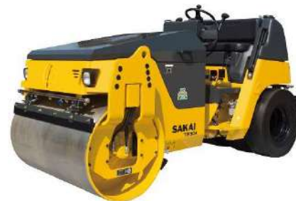
VIBRATORY DOUBLE DRUM ROLLER TW504 3,620Kg (7,980Lb)