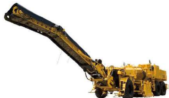
ROAD PLANER ER552F-s 28,170Kg (62,105Lb)