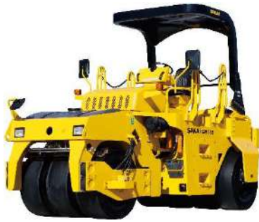
VIBRATORY PNEUMATIC TIRED ROLLER GW753 9,160Kg (20,195Lb)