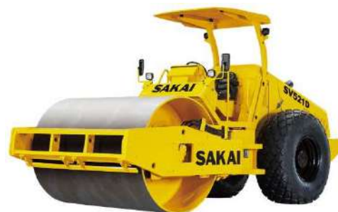
VIBRATORY SINGLE DRUM ROLLER SV521D 10,325Kg (22,765Lb)