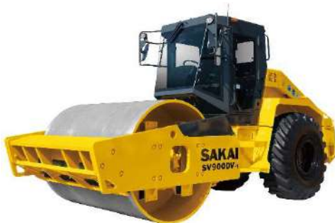
VIBRATORY SINGLE DRUM ROLLER SV900DV 20,030Kg (44,460Lb)

Facebook: https://www.facebook.com/Sakai.Tokyo.Japan