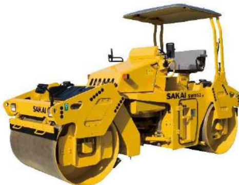
VIBRATORY DOUBLE DRUM ROLLER SW652H-1K/SW654H 8,080Kg (17,815Lb)