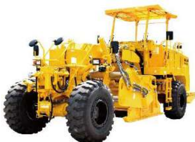
ROAD RECLAIMER PM550-s 22,580Kg (49,780Lb)