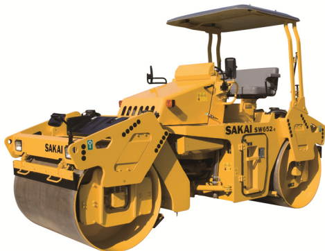
VIBRATORY DOUBLE DRUM ROLLER SW652 7,100Kg(15,650Lb)