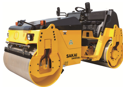
VIBRATORY DOUBLE DRUM ROLLER SW502 4,090Kg(9,020Lb)