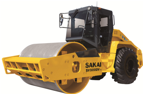
VIBRATORY SINGLE DRUM ROLLER SV900DV 19,950Kg(43,980Lb)

URL: http://www.sakainet.co.jp/english/inquiry/e_inquiry.html