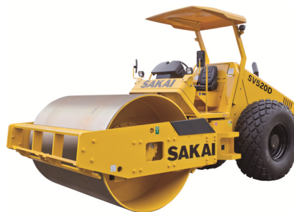
VIBRATORY SINGLE DRUM ROLLER SV520D 10,100Kg(22,265Lb)