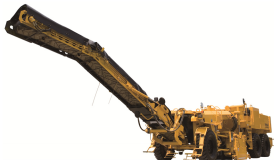
ROAD PLANER ER552F 28,090Kg(61,930Lb)