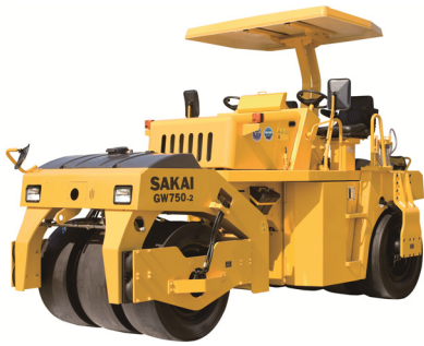
VIBRATORY PNEUMATIC TIRED ROLLER GW750-2 9,040Kg (19,930Lb)