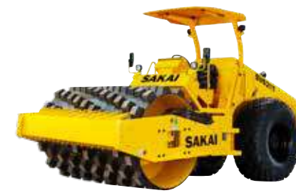
SV621T/T-c 12,970 kg / 12,935 kg