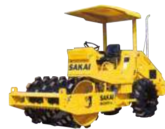
SV201T-1k 4,560 kg