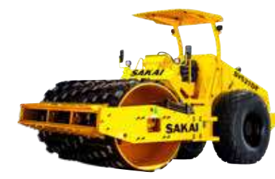
SV521DF/DF-c 11,965 kg / 11,930 kg