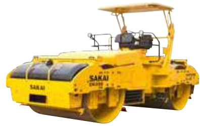
SW988 / SW888 13,610 kg / 13,190 kg