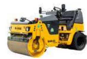
TW354 2,720 kg