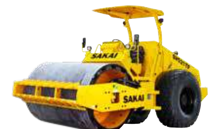
SV521TF/TF-c 12,935 kg / 12,900 kg