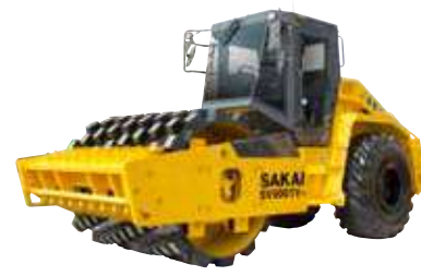
SV900T-1/TV-1 19,725 kg / 20,235 kg