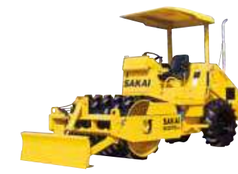
SV201TB-1k 4,790 kg