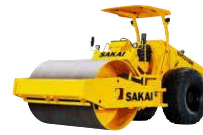
SV521DH 11,220 kg