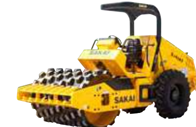
SV414T 7,150 kg