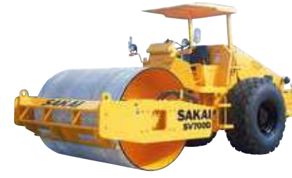
SV700D 15,080 kg