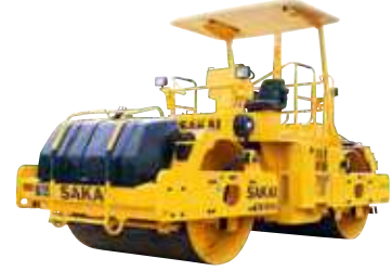
SW800 / SW800N 10,480 kg / 10,890 kg