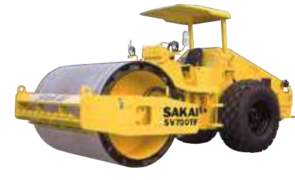
SV700TF 18,080 kg