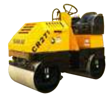
CR271 1,520 kg