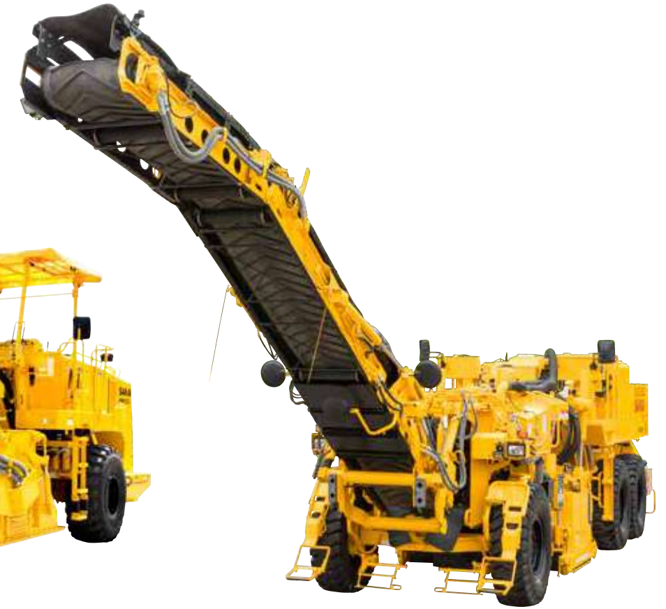
ER555F-s 28,170 kg