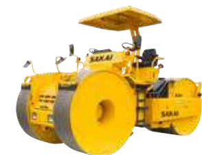
R2H-2k / R2H-2 / R2H-5k 14,070 kg / 14,070 kg / 14,080 kg