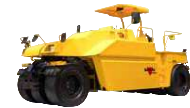
TZ705-k 15,080 kg