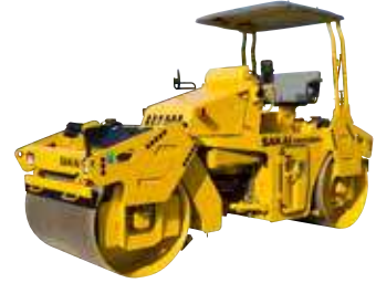
SW652NDH-1 / NDH-1k 8,140 kg / 8,140 kg