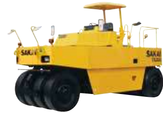
TS200 15,080 kg