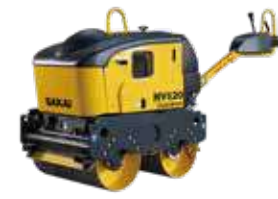
HV620 Guardman 640 kg