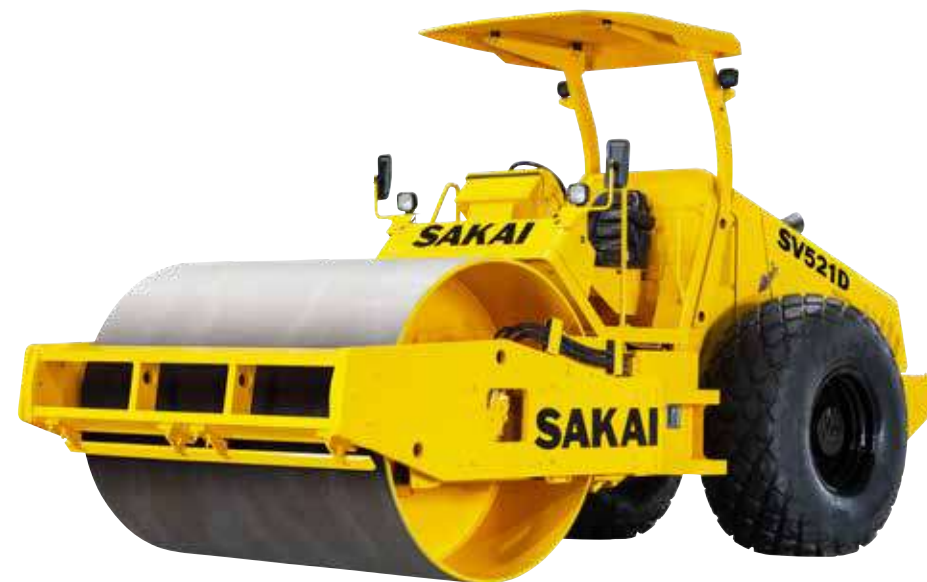
SV521D 10,325 kg