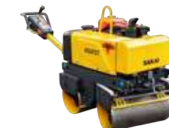
HS67ST 750 kg