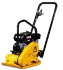
PC6X / 5X 64 kg / 60 kg