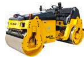
SW502S-1 4,170 kg