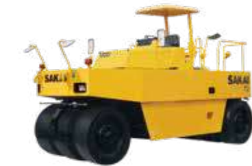
T2 15,580 kg