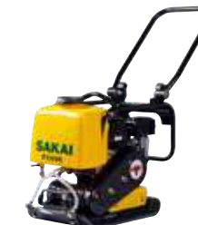
PC600 78 kg