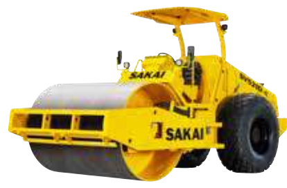
SV521D-c 10,290 kg