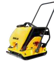
PC800 109 kg