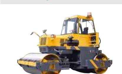
SD451 11,000 kg