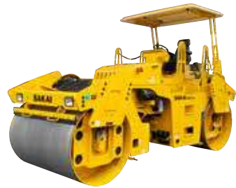
SW774 10,475 kg