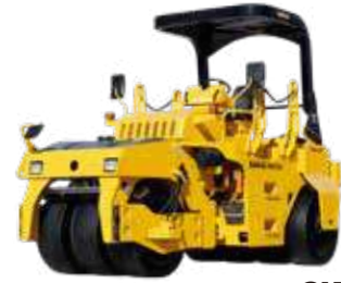
GW753 9,160 kg