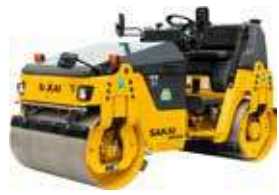
SW354 3,020 kg