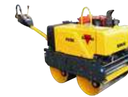
HV80 / ST 760 kg / 780 kg