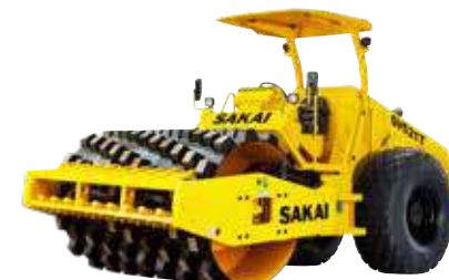
SV521T/T-c 10,665 kg / 10,630 kg