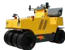
TS160-3 2,955 kg