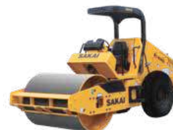
SV414D 7,150 kg