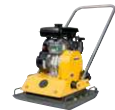
PC81CAH 96 kg