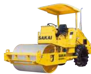
SV201D-1k 4,440 kg