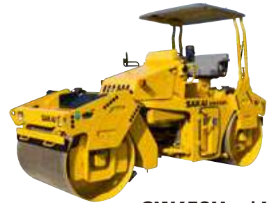
SW652H-1 / H-1k 8,080 kg / 8,080 kg