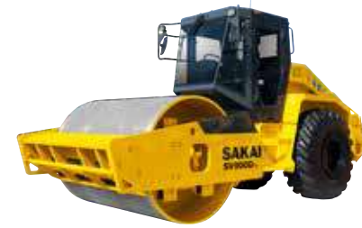
SV900D-1/DV-1 19,525 kg / 20,320 kg