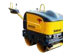
HV620 / 520 640 kg / 620 kg