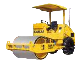
SV201TF-1k 5,250 kg