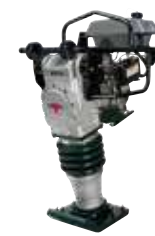
RS75 / 65 / 55 76 kg / 70 kg / 58 kg