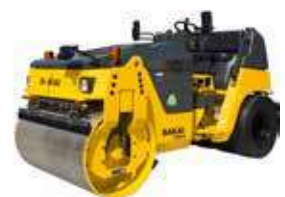
TW504 3,620 kg