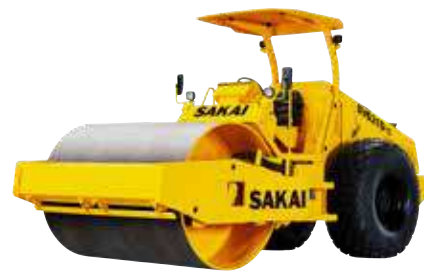
SV621D-c 12,590 kg