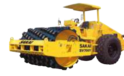
SV700T 15,080 kg