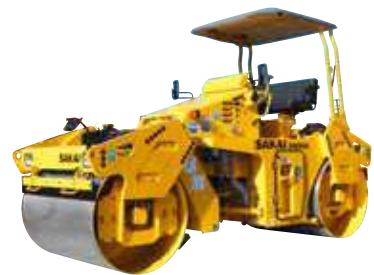
SW655H / ND 8,080 kg / 7,480 kg