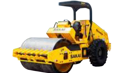
SV414TF 8,380 kg