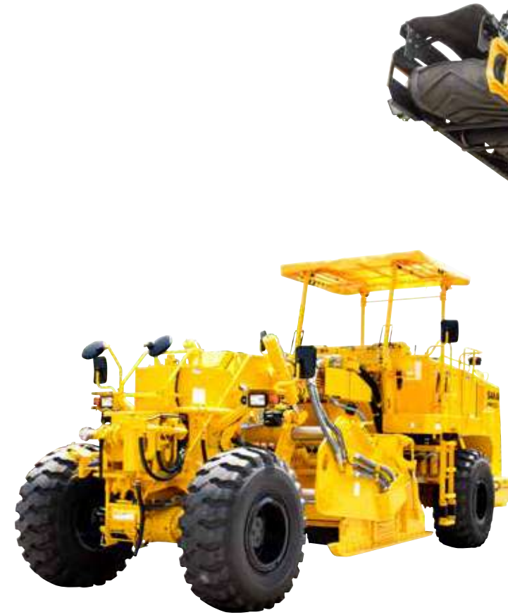
PM550-s 22,560 kg