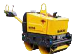
HV58 (High Compaction) 615 kg