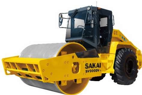
VIBRATORY SINGLE DRUM ROLLER SV900DV 20,030Kg (44,460Lb)

Facebook: https://www.facebook.com/Sakai.Tokyo.Japan