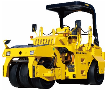
VIBRATORY PNEUMATIC TIRED ROLLER GW753 9,160Kg (20,195Lb)