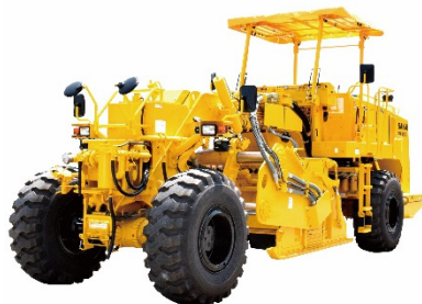
ROAD STABILIZER PM550-s 22,580Kg (49,780Lb)