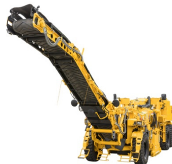
ROAD CUTTER ER555F-s 27,950Kg (61,620Lb) [NEW MODEL]